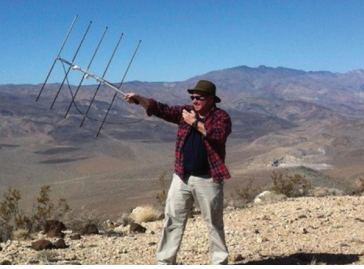
The ELK Antenna.