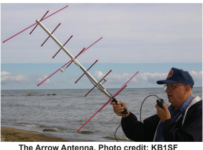
The Arrow Antenna.