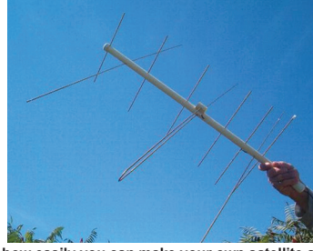
Learn how easily you can make your own satellite antenna