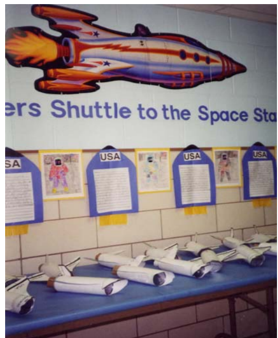
Second graders shuttle to the Space Station

Second graders wrote stories about why they would like to be an astronaut and then made shuttles out of Pringles chip cans. They colored pictures of astronauts and put their own photos in the helmets. Their work decorated the hall outside their classroom.