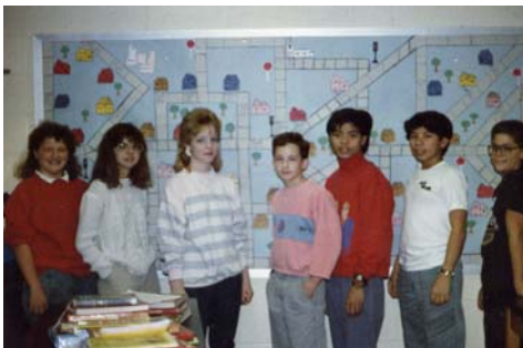
Eighth graders try to pick a name for the new shuttle. (1988)

SAREX and the opportunities being offered for school children to communicate with astronauts on the Shuttle. I was so impressed with the program that I finally sent in my application in 1996. And so the wait began.