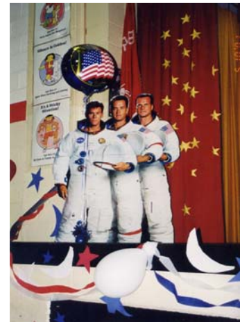
The Apollo 13 movie crew

And we waited. Time passed, students moved on to high school and then college. Teachers retired and a new group moved into their places. We waited for a Shuttle contact. Next it was Mir. I remember visiting Jerling Jr. High when they had their contact with Capt. Jerry Linenger (KC5HBR) on board the Mir space station. I kept pushing the dream, while we waited longer. My room was always filled with Hubble photos, NASA posters, and standing in the corner, was the life size trio from the movie Apollo 13.