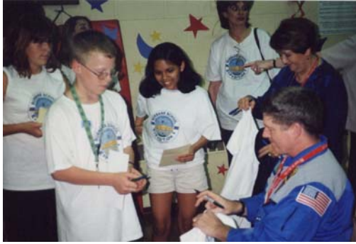
Cmdr. Shepherd signs autographs for the Burbank/ISS team

answered questions from students. What he really wanted to talk about was the kids and what was available to them if they just worked hard. “The first crew for the Mars mission already exists,” Shepherd told a rapt audience as he explained what big step was next for NASA. “We just don’t know who they are yet. That’s the problem. I’ll leave it up to you to do what needs to be done to get there.” Shepherd told them that the choices they make, even at an early age, could have consequences that ripple throughout their lives. Upon leaving the gym we headed out to the front of the school where a group of kindergarten through second grade students sat in the grass anxiously awaiting the astronaut from the space station. After sharing some thoughts with them, he answered some of their questions. He was surprised when our music teacher led them all in a song entitled “Mission Control”. Then it was back to the gym where he graciously gave numerous autographs and