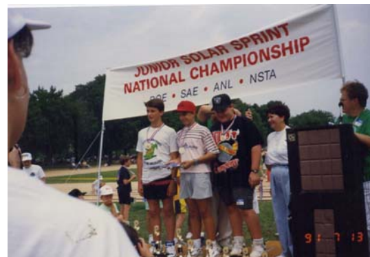
Receiving a trophy at the Junior Solar Sprint National Championship race in D. C.

We became involved with Argonne National Laboratory's Junior Solar Sprint. Students designed built and raced solar powered cars. We were lucky to race in the National Solar Sprint held in Washington D.C. where we placed 5 th in the nation. We went on to win several 1 st and 2 nd places in Argonne's races over the years.