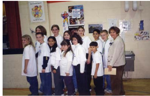
The Burbank/ISS team

every classroom began working on a wide variety of "space topics". Our first graders