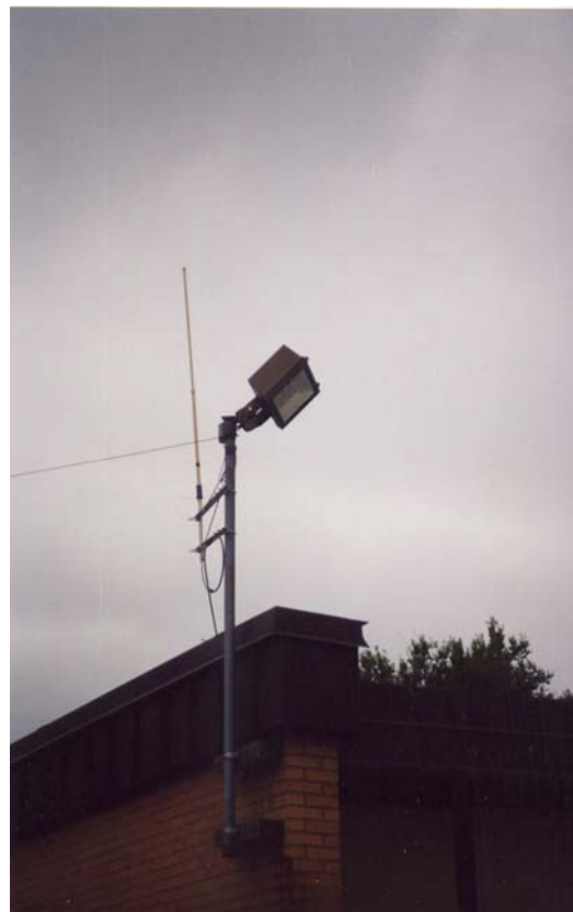
The antennas on Burbank School