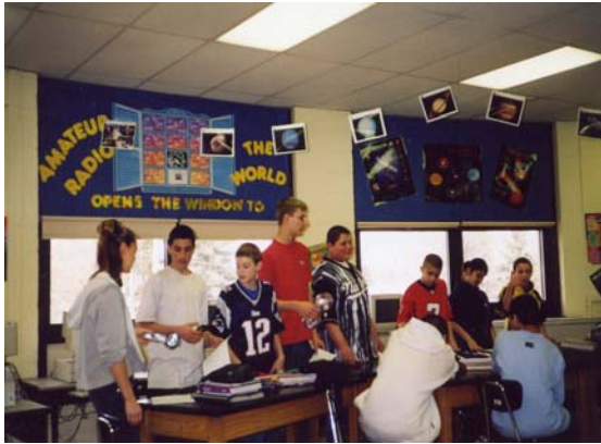
Students participate in the Wheeled Vehicle race

Speaking of racing, every year students had to design a car with as little friction as possible and one that was aerodynamically sound. Students raced these down a 5cm high ramp in the classroom. No motors, batteries, or flywheels were allowed. The students ran the entire race themselves. That included weighing and measuring the vehicles, measuring the distance traveled by the vehicle, and deciding upon a fair grading system.