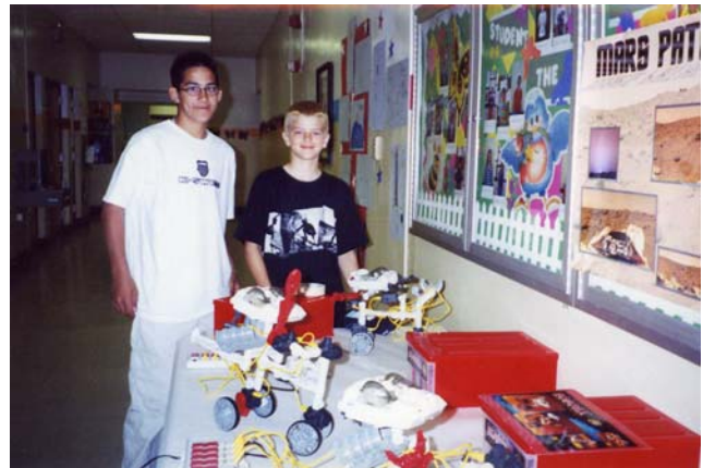
Burbank's Robotics ready for Mars

From Newton's laws to the theory of flight to the building of rockets and looking into the Universe with help from Hubble photos. We researched, studied, wrote, designed, built and thoroughly enjoyed our adventure. We especially liked the trip to the space center in Woodstock, IL where students flew in a 737 simulator! Among all of that were trips to Argonne National Lab, Fermi Lab, and even appearing with Bill Kurtis on the show "Different Drummers".