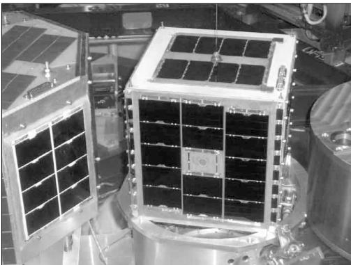
Dubbed “Echo” before launch, the AO-51 satellite sits in the “Space Head Module,” the upper stage of its launch vehicle at the Baikonour Launch Complex in Kazakhstan.

Most amateur satellites operate on a published schedule that lists when its various transponders will be switched on and off and at what times. As AO-51 has multiple transponders, it’s very important to always check the published schedule for the satellite before you attempt to use it. AO-51’s current operating schedule is always available via the AO-51 Control Team page