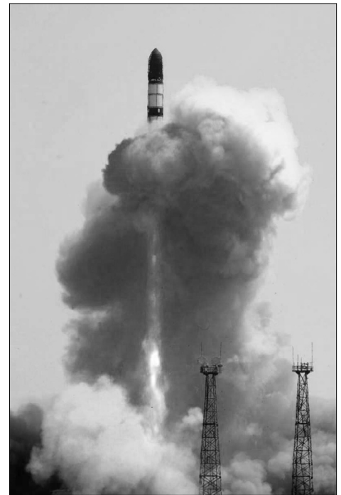
The AO-51 satellite launches on a converted Russian ICBM rocket on 29 June, 2004 from the Baikonour Launch Complex in Kazakhstan.

You will also note that AO-51's satellite passes at your location follow a repeating