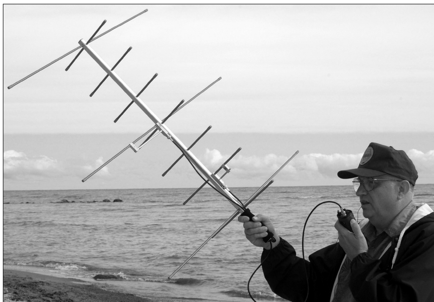
The author uses a Kenwood TH-78A dual-band HT and a lightweight Arrow Antenna to make a contact through AO-51 from the shores of Lake Huron in Michigan. When used with a 5 watt, full-duplex handheld in an open location free of foliage, such as a beach or a field, the antenna provides enough uplink and downlink gain to successfully work the FM birds, even on passes close to the horizon.

Because they are such a vital ingredient to this part of our hobby (and because they age over time) finding a reliable source for the latest Keplerian Elements for Amateur Radio satellites should be high on your list of things to do as you get started in satellite work. Keps are often listed on many Amateur Radio Internet Web sites. The AMSAT-North America Web site lists the latest Keps in a variety of downloadable formats at: www.amsat.org .