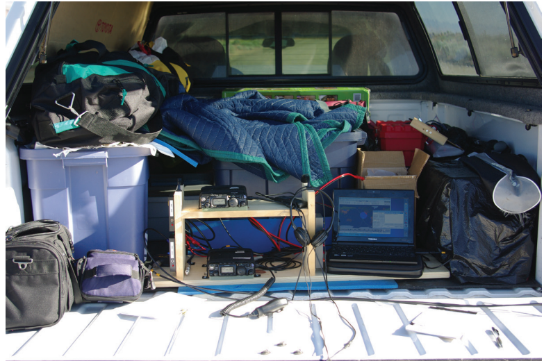
KA6SIP Equipment setup for linear sats

At PACIFCON I had run the demos of linear satellites using a twin Yaesu FT-817 setup similar to the setup from Dave, KB5WIA. Each radio was connected to an Arrow antenna via coax cables with BNC connectors. I also used the Arrow duplexer mounted inside the boom, on the 2-meter coax as a low-pass filter. This setup worked well. I then decided to swap out one FT-817 with an FT-897, but it seemed that no matter what I tried, I was never satisfied with the results, so I went back to the twin FT-817s at the last minute. One thing I did change was that I ran both radios and preamps from an external 28 Ah SLA/AGM battery instead of using the internal batteries. This way I could run several days without worrying about low voltage. Since it looked like the portable work could be done based out of my pickup, I tried mounting the radios &