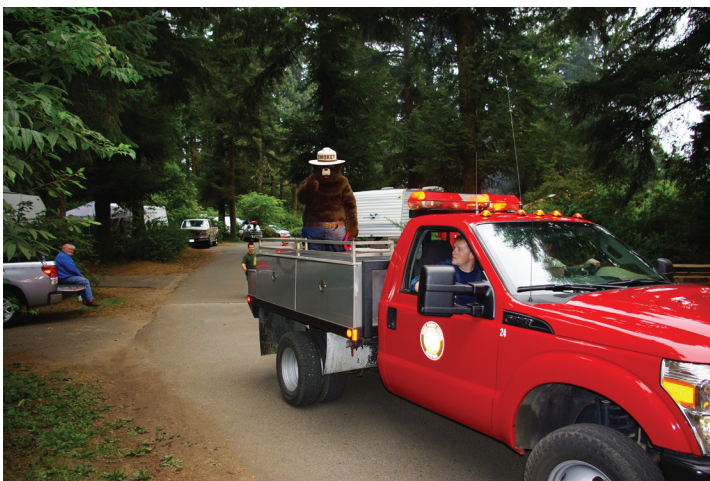
(left) Smokey the Bear visited the campground to investigate who was burning up the bands.