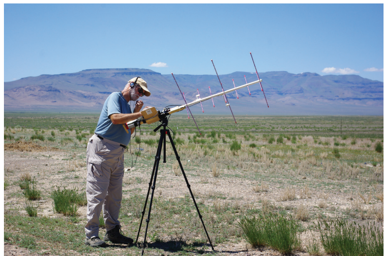
Day 4: SO-50 from DN12