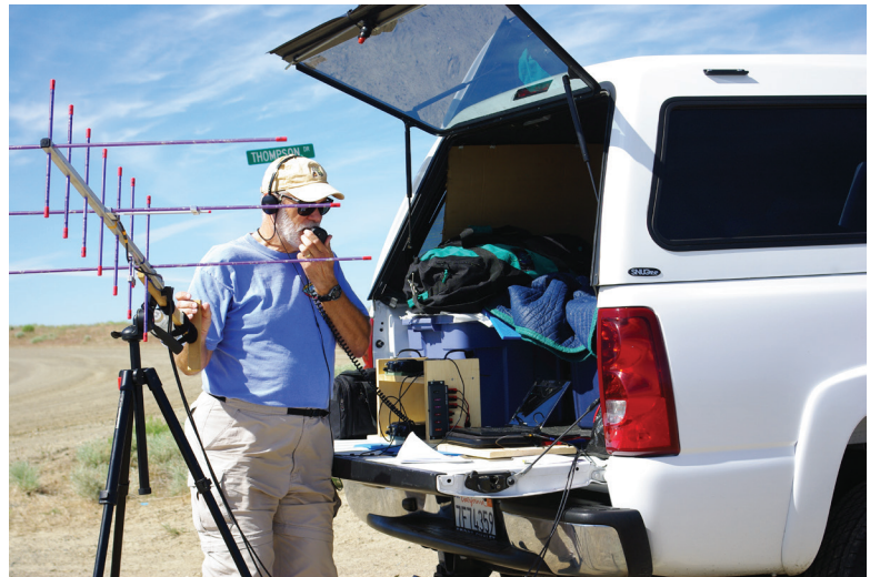
Day 3: Linear Operation from DN10/DN11