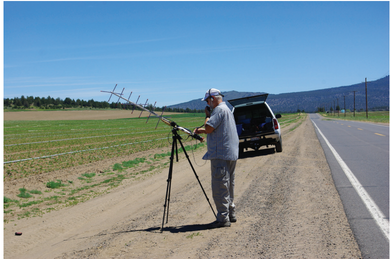
Day 9: SO-50 from CN81/CN91 grid boundary

A morning pass of FO-29 was made from DN10 in the middle of the airfield again. Then after breakfast at the cafe, we headed to Goose Lake State Park in Oregon, just south of Lakeview Oregon. A stop was made along the way in DN02 to operate SO-50. The pass