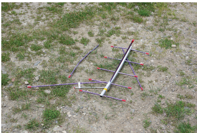
Day 8: Sad sight of top section of Arrow antenna after driving over it

preamps to a board that could travel pretty much as-is between locations and cut down on the set up time.