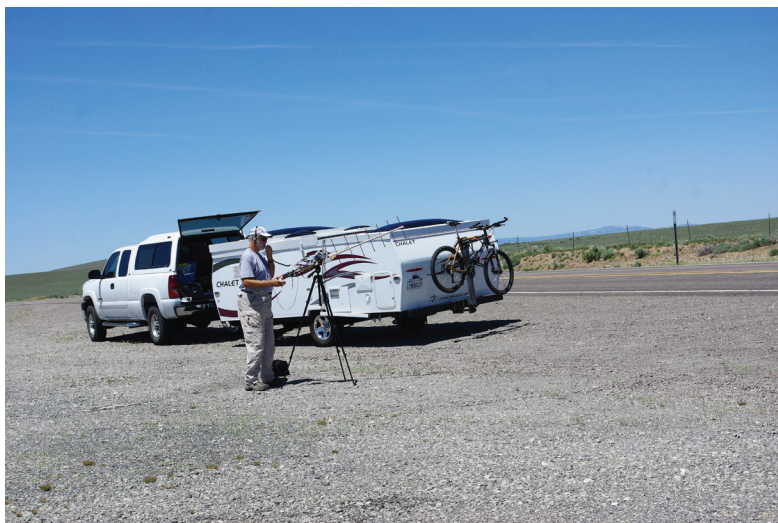
Day 6: SO-50 from DN02 traveling to Goose Lake, OR