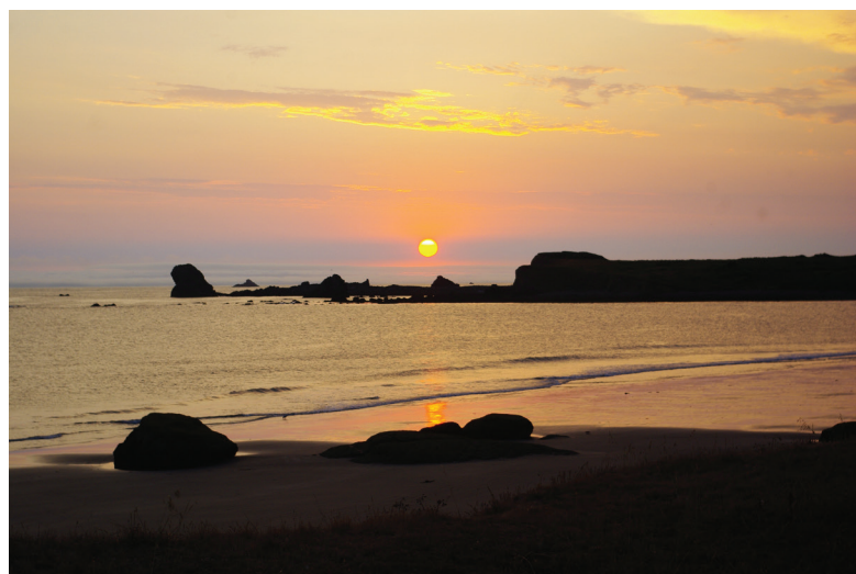
FO-29 Sunset Operation from CN71 - Crescent City, CA

We were going to try to operate from CN90 this day, but we had a long travel day ahead. We cancelled out on any passes. We drove from Klamath Falls to Lake Tahoe, which was around 350 miles. It was quite a day! We drove through forests and back down to upper desert. At one point it was 103° F. We