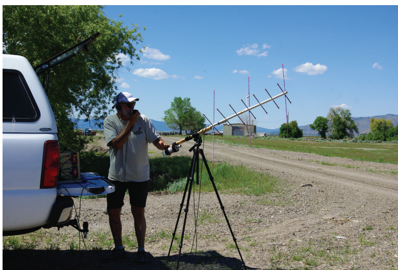
Day 7: AO-07b from CN92