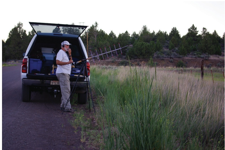
Day 10: Last Pass - FO-29 from CN91