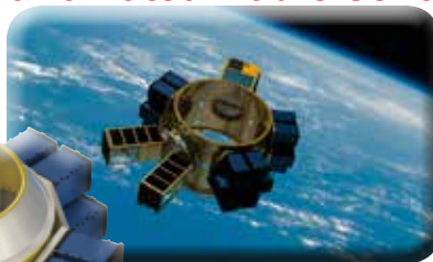
AMSAT Fox-1C will fly aboard the 2015 SHERPA SpaceX Falcon 9 launch