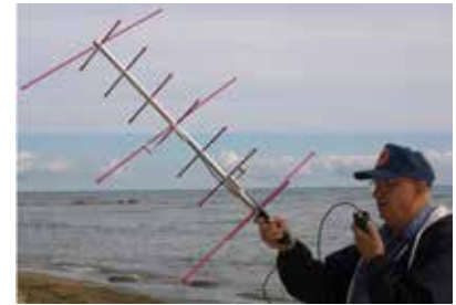
The Arrow Antenna.

If Fox-1 is heading directly toward you, the Doppler shift will be greatest, but except for passing overhead, it will change relatively slowly. Passes well to the east or west will have smaller maximum shift, but it will change continuously throughout the pass. Learning to compensate for this is a necessary operator skill. Using the recommended full-duplex operation will allow you to hear if you are tuned on-frequency.