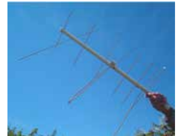
Learn how easily you can make your own satellite antenna