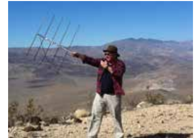
The ELK Antenna.