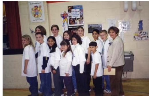
The Burbank/ISS team

every classroom began working on a wide variety of "space topics". Our first graders