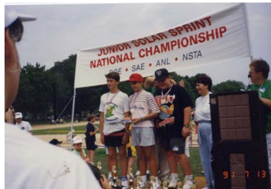
Receiving a trophy at the Junior Solar Sprint National Championship race in D. C.

We became involved with Argonne National Laboratory's Junior Solar Sprint. Students designed built and raced solar powered cars. We were lucky to race in the National Solar Sprint held in Washington D.C. where we placed 5 th in the nation. We went on to win several 1 st and 2 nd places in Argonne's races over the years.