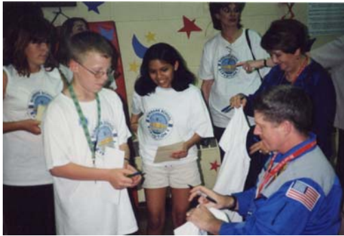
Cmdr. Shepherd signs autographs for the Burbank/ISS team

answered questions from students. What he really wanted to talk about was the kids and what was available to them if they just worked hard. “The first crew for the Mars mission already exists,” Shepherd told a rapt audience as he explained what big step was next for NASA. “We just don’t know who they are yet. That’s the problem. I’ll leave it up to you to do what needs to be done to get there.” Shepherd told them that the choices they make, even at an early age, could have consequences that ripple throughout their lives. Upon leaving the gym we headed out to the front of the school where a group of kindergarten through second grade students sat in the grass anxiously awaiting the astronaut from the space station. After sharing some thoughts with them, he answered some of their questions. He was surprised when our music teacher led them all in a song entitled “Mission Control”. Then it was back to the gym where he graciously gave numerous autographs and