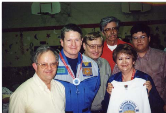
Cmdr. Shepherd meets the Ham Radio team

answered questions from students. What he really wanted to talk about was the kids and what was available to them if they just worked hard. “The first crew for the Mars mission already exists,” Shepherd told a rapt audience as he explained what big step was next for NASA. “We just don’t know who they are yet. That’s the problem. I’ll leave it up to you to do what needs to be done to get there.” Shepherd told them that the choices they make, even at an early age, could have consequences that ripple throughout their lives. Upon leaving the gym we headed out to the front of the school where a group of kindergarten through second grade students sat in the grass anxiously awaiting the astronaut from the space station. After sharing some thoughts with them, he answered some of their questions. He was surprised when our music teacher led them all in a song entitled “Mission Control”. Then it was back to the gym where he graciously gave numerous autographs and