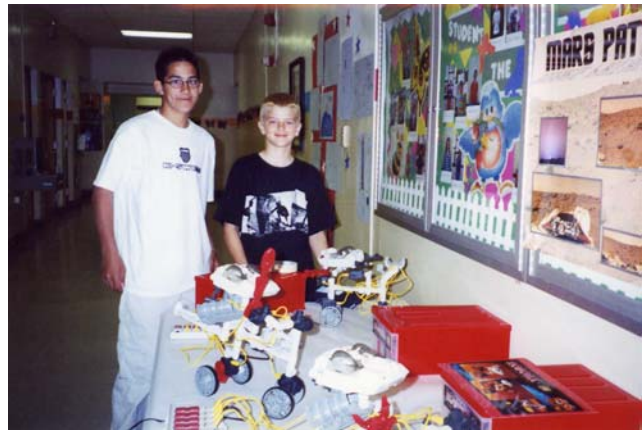
Burbank's Robotics ready for Mars

From Newton's laws to the theory of flight to the building of rockets and looking into the Universe with help from Hubble photos. We researched, studied, wrote, designed, built and thoroughly enjoyed our adventure. We especially liked the trip to the space center in Woodstock, IL where students flew in a 737 simulator! Among all of that were trips to Argonne National Lab, Fermi Lab, and even appearing with Bill Kurtis on the show "Different Drummers".