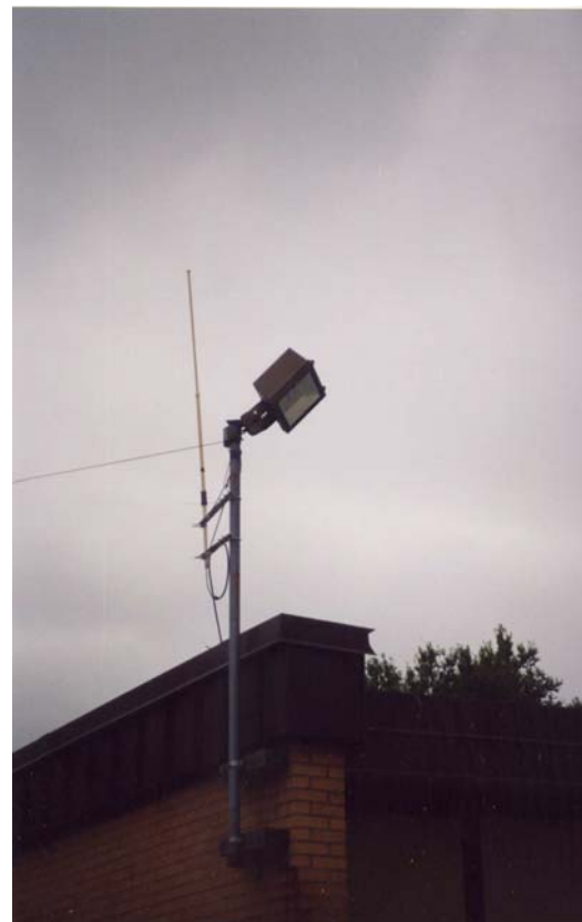
The antennas on Burbank School

Our ARISS contact and subsequent visit by Commander Shepherd was like tossing a pebble into a stream. The ripple effects are still occurring and I suspect will continue to occur for a long time. We have a young staff and witnessing these events has inspired some to look for other interdisciplinary projects. They are beginning their dream. Many of our students are looking forward to careers associated with the space industry. As for myself, I keep looking up. I know we can put a bigger antenna on that school!