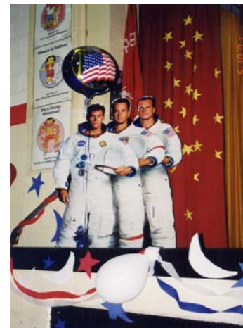
The Apollo 13 movie crew