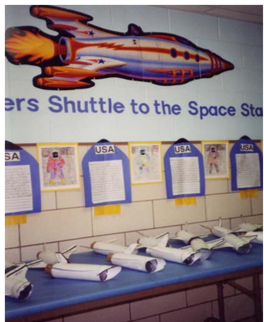
Second graders shuttle to the Space Station

Second graders wrote stories about why they would like to be an astronaut and then made shuttles out of Pringles chip cans. They colored pictures of astronauts and put their own photos in the helmets. Their work decorated the hall outside their classroom.