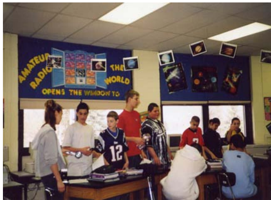
Students participate in the Wheeled Vehicle race

Speaking of racing, every year students had to design a car with as little friction as possible and one that was aerodynamically sound. Students raced these down a 5cm high ramp in the classroom. No motors, batteries, or flywheels were allowed. The students ran the entire race themselves. That included weighing and measuring the vehicles, measuring the distance traveled by the vehicle, and deciding upon a fair grading system.