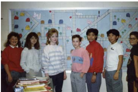
Eighth graders try to pick a name for the new shuttle. (1988)

SAREX and the opportunities being offered for school children to communicate with astronauts on the Shuttle. I was so impressed with the program that I finally sent in my application in 1996. And so the wait began.